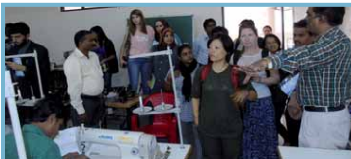
Interaction with Entrepreneurs at RUDSETI, Nelamangala, Karnataka