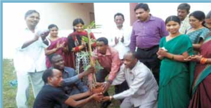
Tree plantation by International Participants at Model Village Gangadevally