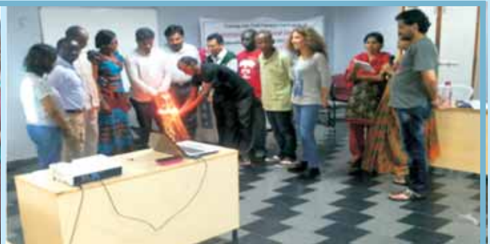
Participants lighting the lamp at Bala Vikasa Community Development Programme