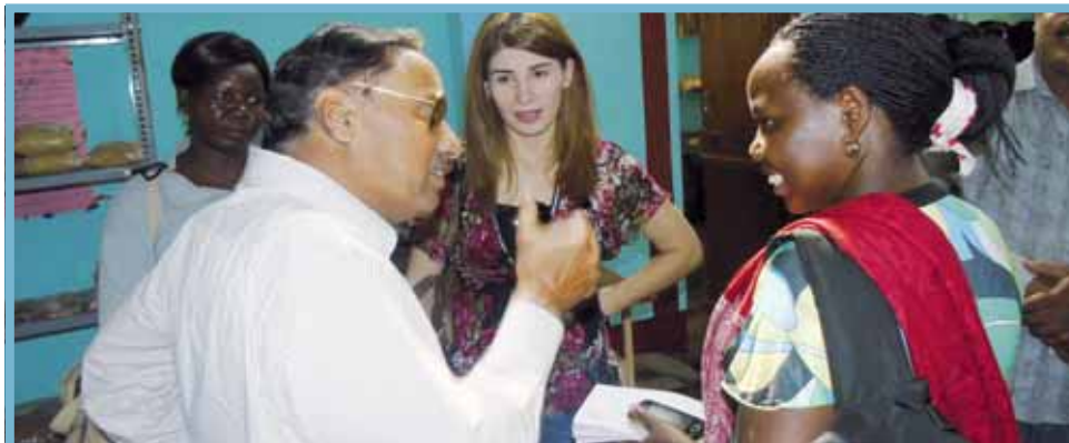
Visit to Community Seed Bank (CSB) at Therubeedi Yelachavadi, Ramnagar District, Karnataka