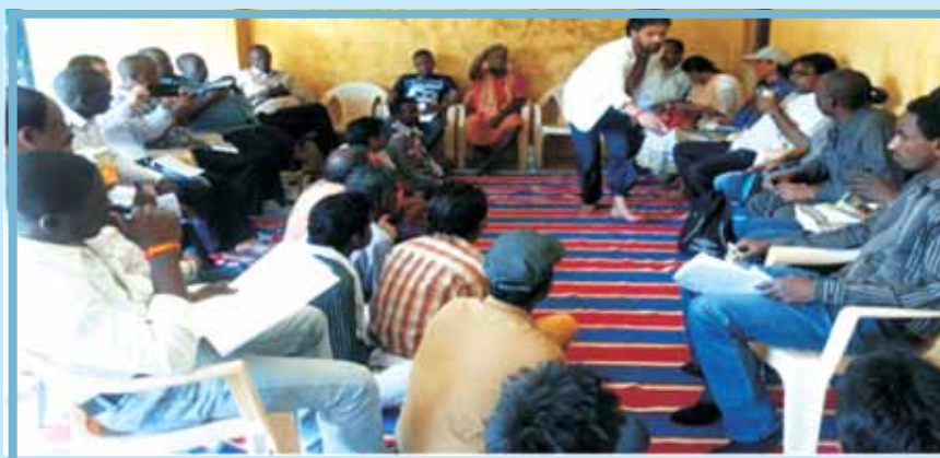
Participants interacting with the community