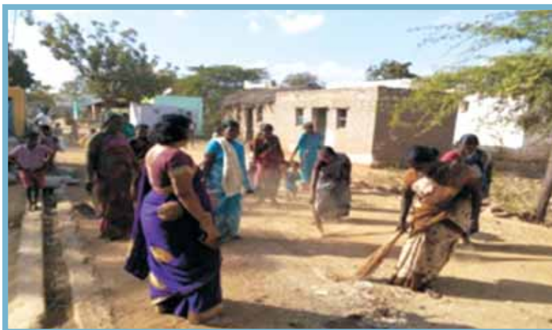
Residents cleaning their colony

The Action Research team also carried out Swachh Bharat programme in Nagireddypalli village, Kudaire mandal of Anantapur district of Andhra Pradesh on 30-12-2014. The participants involved were Self-Help Group members, school teachers and children. All members were divided into small groups and involved in cleaning at different places such as SC colony, BC colony, Chowdamma temple, water tank, surrounding of gundam and premises of school.